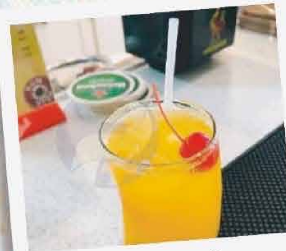
Touch of Bajan