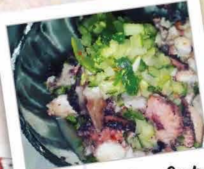
Pickled Sea Cat