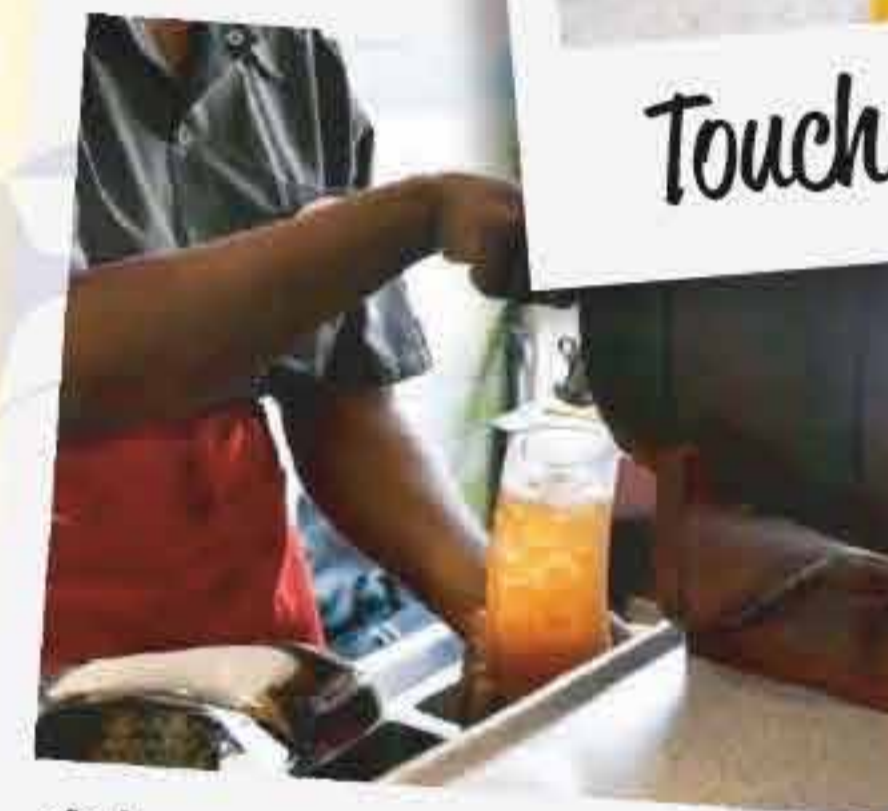
Rhum Punch Barrel