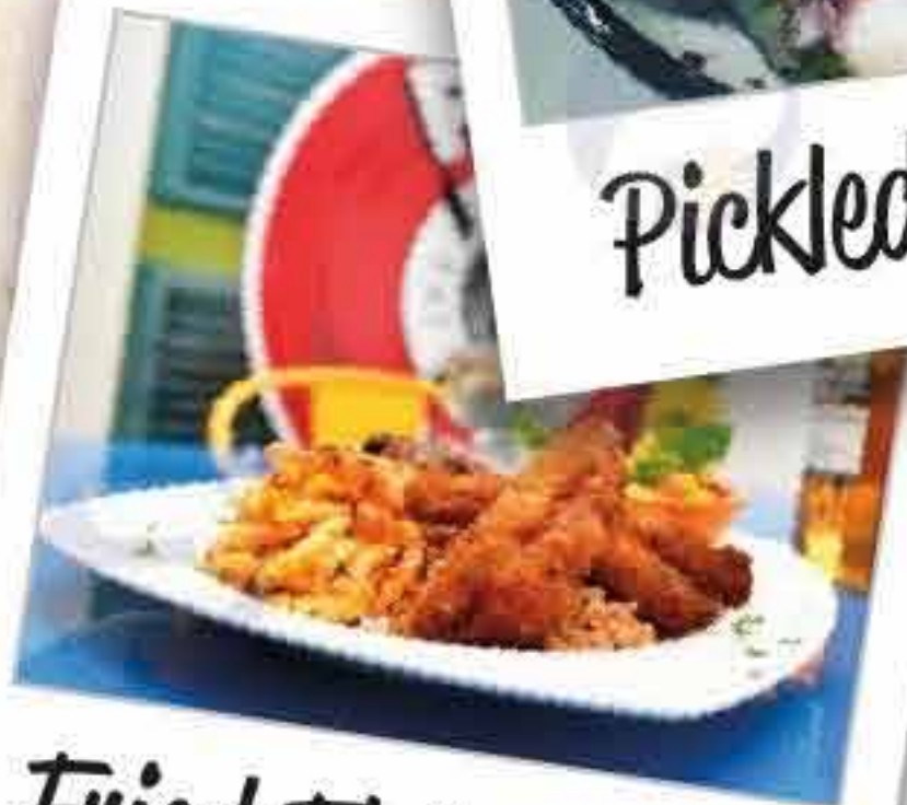
Fried Flying Fish